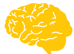
Adult brain 1.25 kg