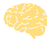
Brain at 6 months 0.64 kg